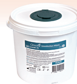
Product reference: OODW-70

Oosafe® Disinfectant for CO 2 Incubators and Laminar Flow Hoods, 5 Liters refill container