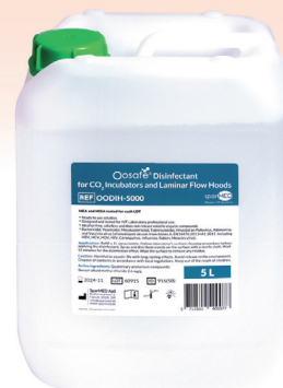
Product reference: OODIH-5000

Oosafe® Disinfectant for CO 2 Incubators and Laminar Flow Hoods, 1 Liter bottle with spray