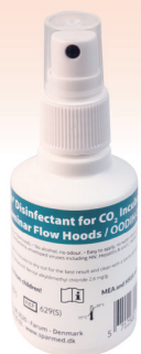
Product reference: OODIH-0050

Disinfection of CO 2 incubators and laminar flow hoods.