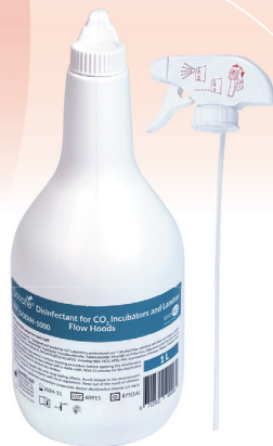
Product reference: OODIH-1000

Oosafe® Disinfectant for CO 2 Incubators and Laminar Flow Hoods, 50 ml in spray bottle